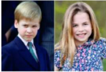
Princess Charlotte Is Dad Prince William's Lookalike in New 6th Birthday Portrait