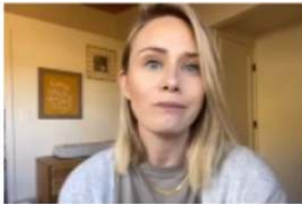
Mom Influencer Charged After Allegedly Fabricating Story that Latino Couple Tried to Kidnap Kids